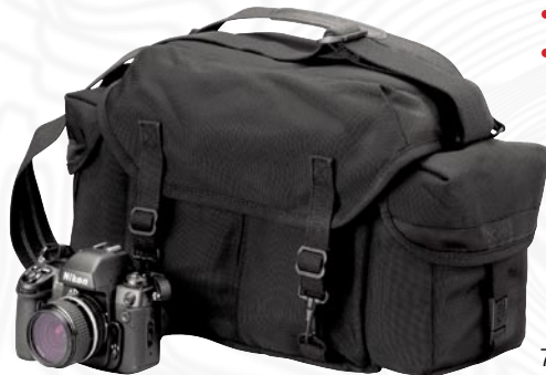
700-J2B – Black Ballistic Nylon

Similar to the J-1 in form and function, the J-2 is slightly smaller in length and height to accommodate a little less gear.