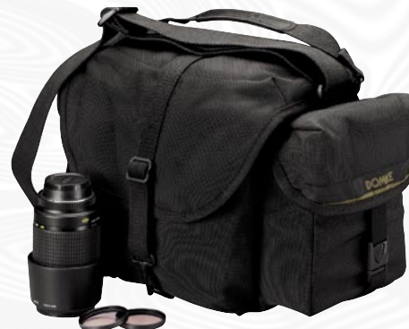
700-J3B – Black Ballistic Nylon

Surprisingly roomy for it's size this compact bag carries more equipment than you would expect.