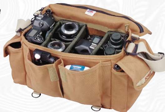
Domke F-2 with two 2-section inserts

Soft Side Construction and Customizable Inserts Allow You to Fit More Equipment Into Less Space.