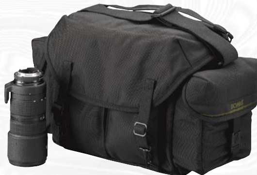
700-J1B – Black Ballistic Nylon

The largest of the Journalist series, it can hold a large diverse assortment of camera gear.