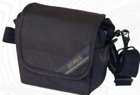
All J-Series Bags available in Black Ballistic Nylon