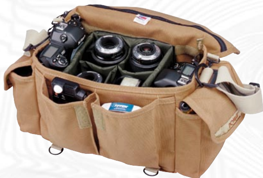
Domke F-2 with one 4-section insert