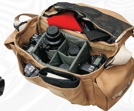
Domke F-1, with 4-section insert holds all this... with room for more!