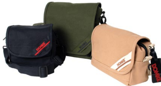
All Domke Classic Bags Available In These 3 Colors

Domke shoulder bags are unlike other bags because of their flexible design and lack of bulk. There are no thick walls and heavy foam or space wasting padding in a Domke bag. This means you can fit more equipment in less space and the bag hugs your hips instead of bouncing against them.